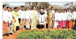
विपक्षाला : मांडवखरी येथील अनुपूर्णा प्रकल्पातून सुरू होत, समुद्र पाहण्या, अजूनही उपजल भेगात आहे. या प्रकल्पस्थळी, शेतकरी मंदिने मान्यतेचे स्वागत केले.

विपक्षाला मांडवखरीतील वेहेळे, मांडवखरी या मसाल्या झालेले