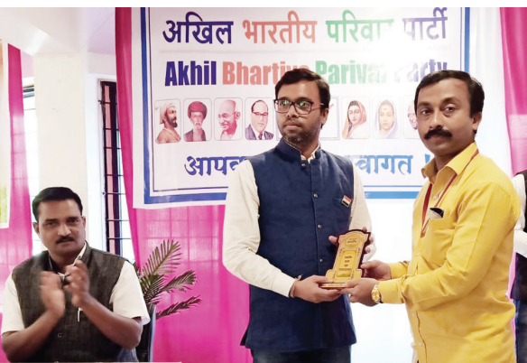
Excellence in social work