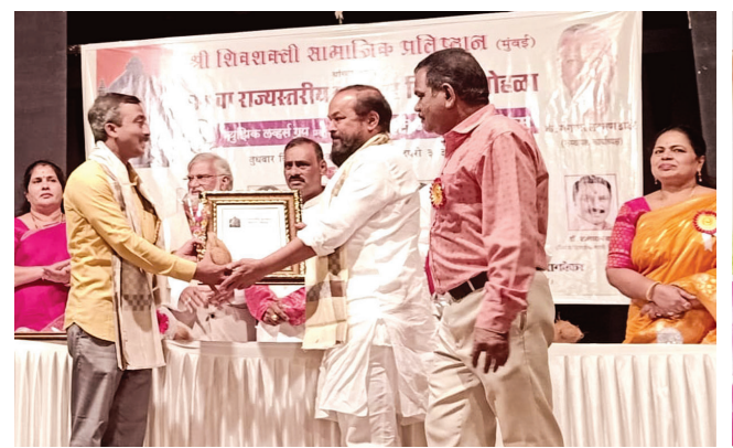
Bharat Sevak Award.