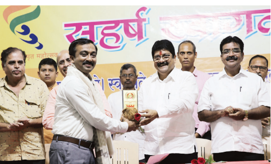
Shree Ganesh Gauray award