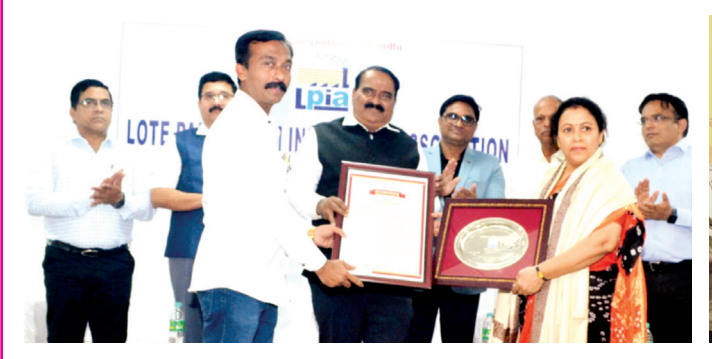
Konkan Gaurav Award